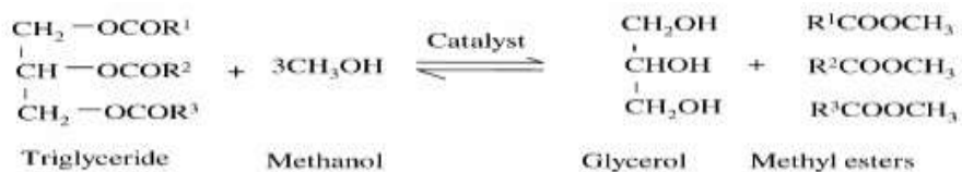
Fig. (1): General Equation for transesterification of triglycerides (1)

Transesterification of triglycerides produces fatty acid alkyl esters and glycerol as by product. The glycerol layer settles down at the bottom of the reaction vessel. Diglycerides and monoglycerides are the intermediates in this process. The mechanism of transesterification is described in equation.2, the step wise reactions are reversible and a little excess of alcohol is used to shift the equilibrium towards the formation of esters. In presence of excess alcohol, the forward reaction is pseudo-first order and the reverse reaction is found to be second order. It was also observed that transesterification is faster when catalyzed by alkali (Özcan and Aydın, 2004). The mechanism of alkali catalyzed transesterification is described in Equation.3. The first step involves the attack of the alkoxide ion to the carbonyl carbon of the triglyceride molecule, which results in the formation of a tetrahedral intermediate. The reaction of this intermediate with an alcohol produces the alkoxide ion in the second step. In the last step the rearrangement of the tetrahedral intermediate gives rise to an ester and a diglyceride (Rojer et al. , 2008).