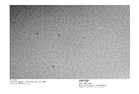
Figure (1) TEM imaging of nano-selenium (NSe)

Vol. (51); Iss. (12); No. (7); Dec. 2022 ISSN 1110-0826 ONLINE ISSN 2636 - 3178