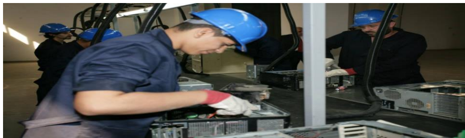
Figure 9B: Disassemble Line Production