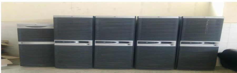
Figure 8: Scrap server