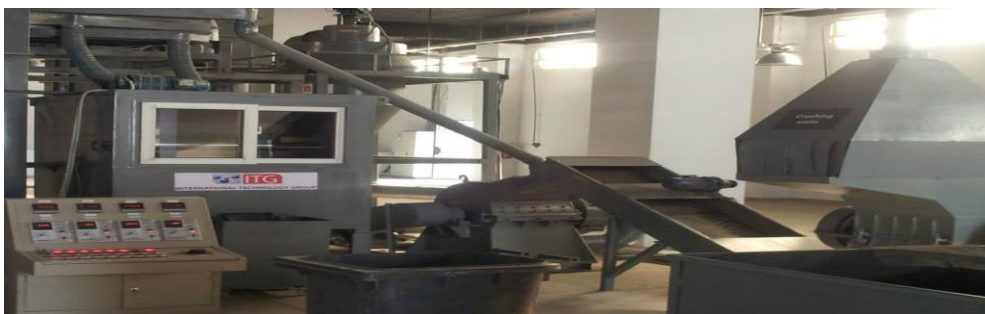
Figure 10.B: E-waste recycling Line