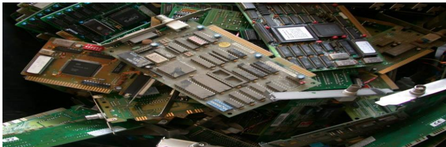
Figure 7: Scrap printed circuit Board