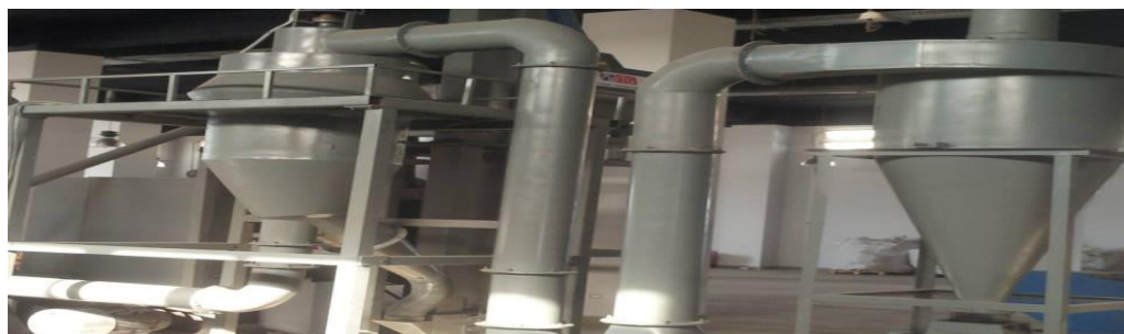
Figure 10.E: E-waste recycling Line

Factory production line consists of four phases, the first begins with a "cracker" until it reaches the metal thickness to 4 cm, then begin "grinding metal" process to become in the form of a 2-inch or 3 mm meters almost powder, then the "Sichaelor", a pneumatic pumps to assemble at least density in place and the largest in the other place, and the third stage of the analysis, by introducing the article in the "sieve vibration", and then the fourth and final stage, which is to separate the metals mixture from each other such as gold, silver platinum and other precious raw materials stage in place by electric charges, and plastic elsewhere.