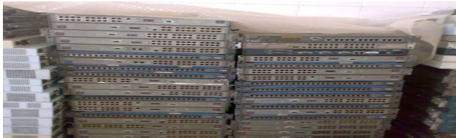
Figure 4: Scrap Network