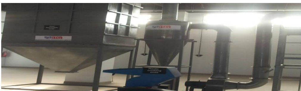
Figure 10.C: E-waste recycling Line