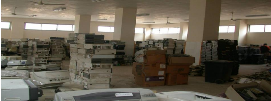
Figure 3: Scrap Monitors