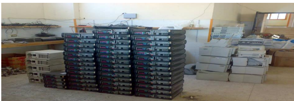
Figure 1: Scrap Desktop Computers