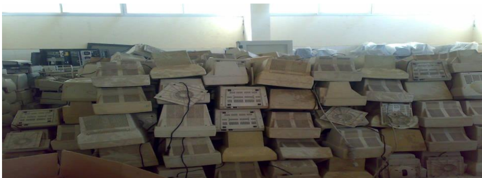
Figure 2: Scrap Monitors