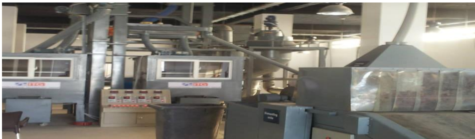
Figure 10.A: E-waste recycling Line