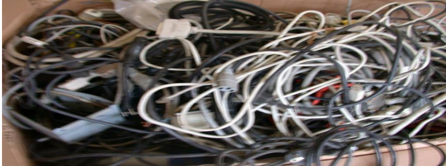
Figure 6: Scrap Cable