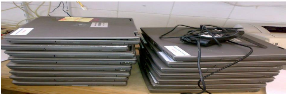
Figure 5: Scrap Network