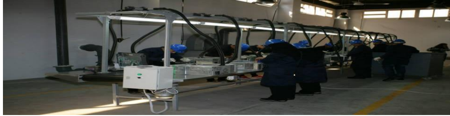
Figure 9.A: Disassemble Line Production